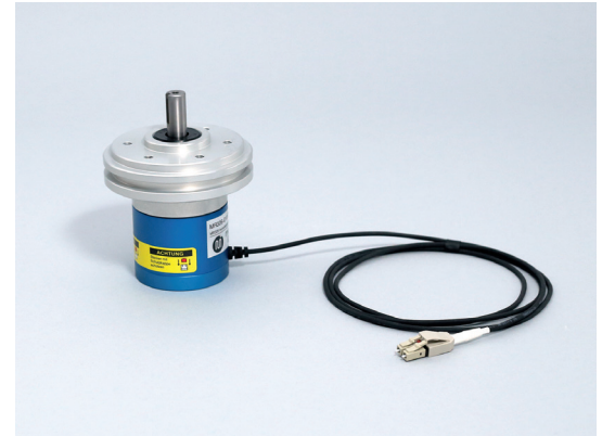
U.S Patent 7,196,320 Inherently Safe, Simple Mechanical Device EPL Mb/Gb/Gc/Db/Dc

Robust IP66 construction together with the optical and mechanical simplicity of the sensor's design offers exceptional reliability in the most physical demanding indoor and out door applications, including cable cars, electric trains, steel mills, bridges, oil rigs, and mines.